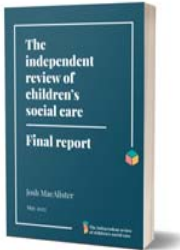
The Independent Review of Children’s Social Care

Three reviews were published last year, provided impetus and vision to transform children’s social care.